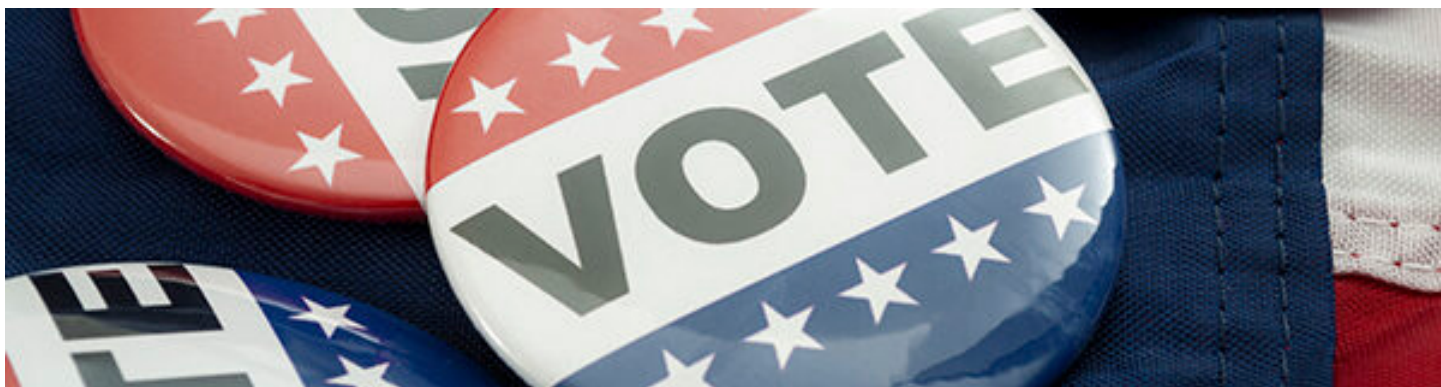
Photo: Red, white and blue buttons with stars and the word “VOTE” printed on them.

For New York City Voters with vision impairment who have requested an accessible ballot from the Board of Elections, Lighthouse Guild is providing access to print the ballots and assistance with printing them. To register for this program or for more information, visit our events section of the website .