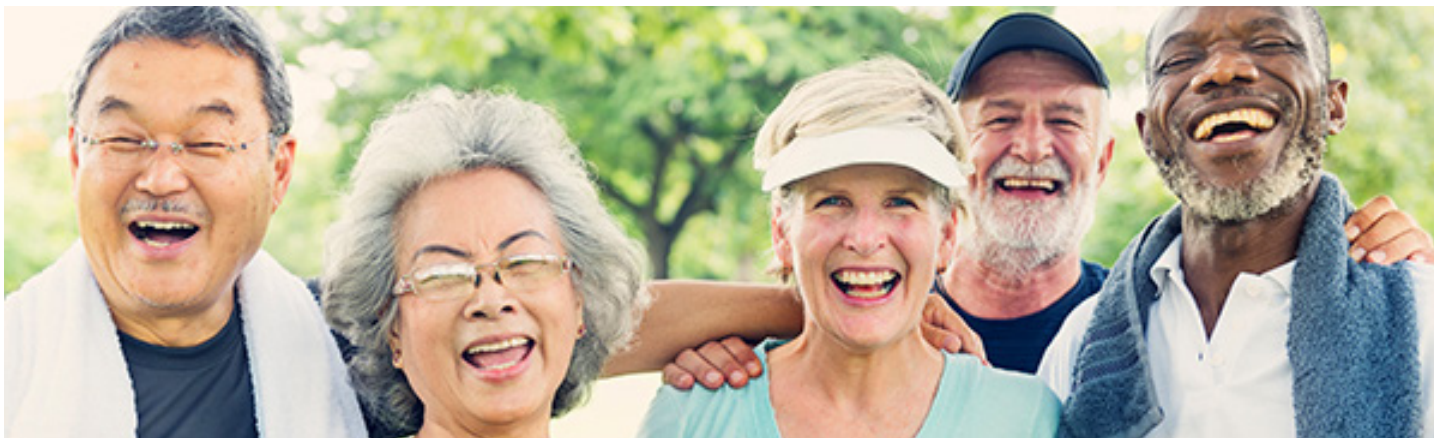
Photo: A group of older adults pose wearing workout clothing, glasses and hats and visors.

Maintaining our health and quality of life as we age requires us to prioritize the protection of our vision. Regular eye exams and early detection are essential for maintaining good eye health, just like many other aspects of our overall health.