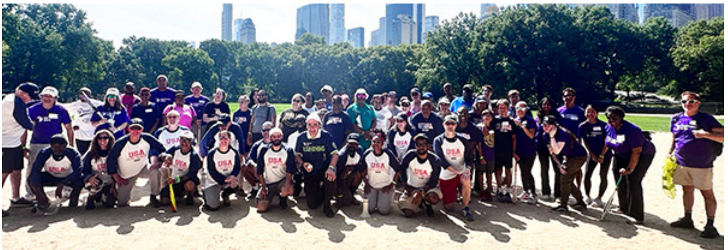
Photo: Lighthouse Guild staff, volunteers, USBBA players and coaches, Team USA players and clinic participants pose on a baseball field in Central Park.

Lighthouse Guild and the U.S. Blind Baseball Association (USBBA) teamed up for the second annual public Blind Baseball Clinic in Central Park. Participants who are blind, visually impaired, or sighted, were encouraged to experience this rapidly growing adaptive sport which included a demonstration by USBBA players, a skills clinic covering batting, running, throwing, and fielding, and a scrimmage. It was my privilege to announce the players who were selected to represent Team USA in the 2024 Blind Baseball International Cup in London. Check out our website for highlights!