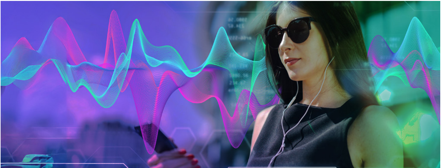
Photo: A woman with dark glasses navigating her surroundings using her iPhone. Purple and blue sound waves radiate around her.