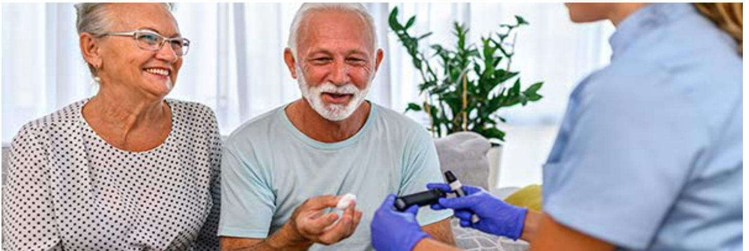
Photo: A nurse uses a glucometer to check a male patient's blood sugar levels.

According to the Centers for Disease Control and Prevention (CDC), over 38 million Americans have diabetes, which means that about 1 in 10 people in the U.S. are affected. At Lighthouse Guild, we recognize that one of the most serious complications related to diabetes is vision loss. Fortunately, you can help reduce the risk and preserve eyesight.