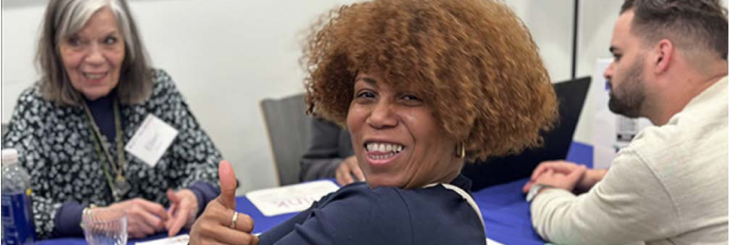
Photo: A woman is smiling and giving a “thumbs up” sign while sitting with volunteers who are assisting her to register for Team #SeeNoLimits

Our TD 5 Boro Bike Tour Kickoff Event with Team #SeeNoLimits was a tremendous success. New and prospective riders had the opportunity to learn more about the tour and get their questions answered. The energy and enthusiasm at the event were palpable, which contributed to 11 new riders signing up for the team.