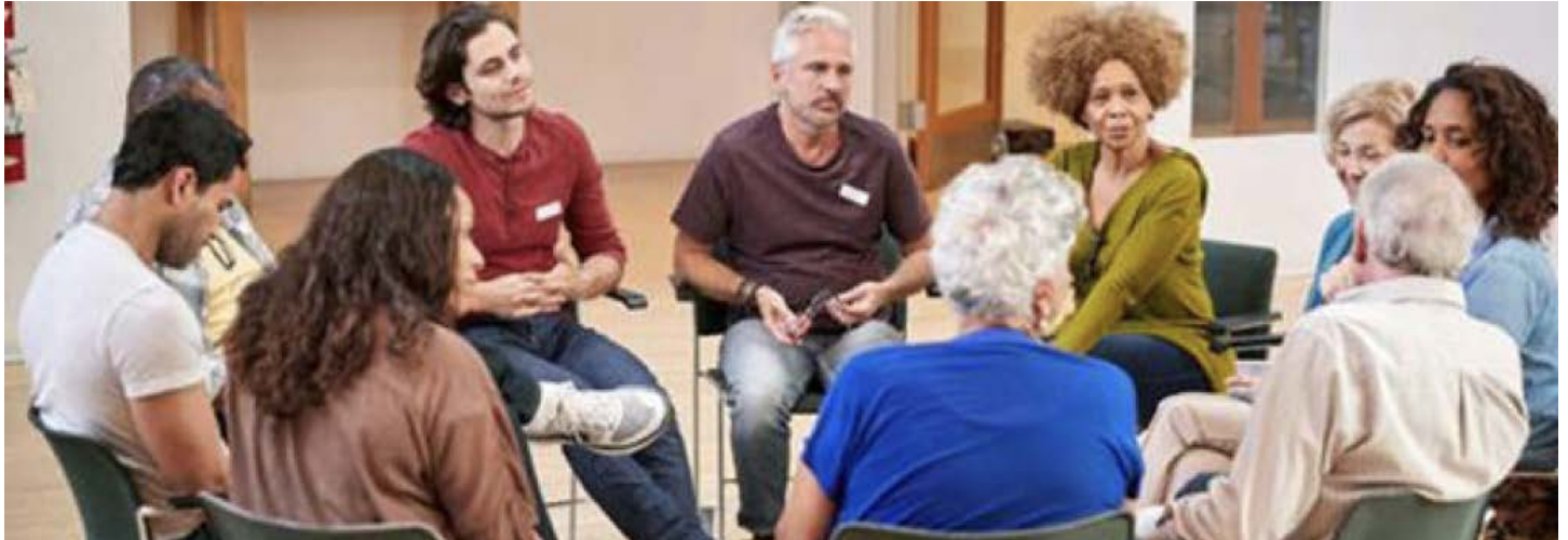
Photo: A support group comprised of 10 people of various ages and genders sitting in a circle.

Ms. Tapia recommends the following tips for mental health and self-care.