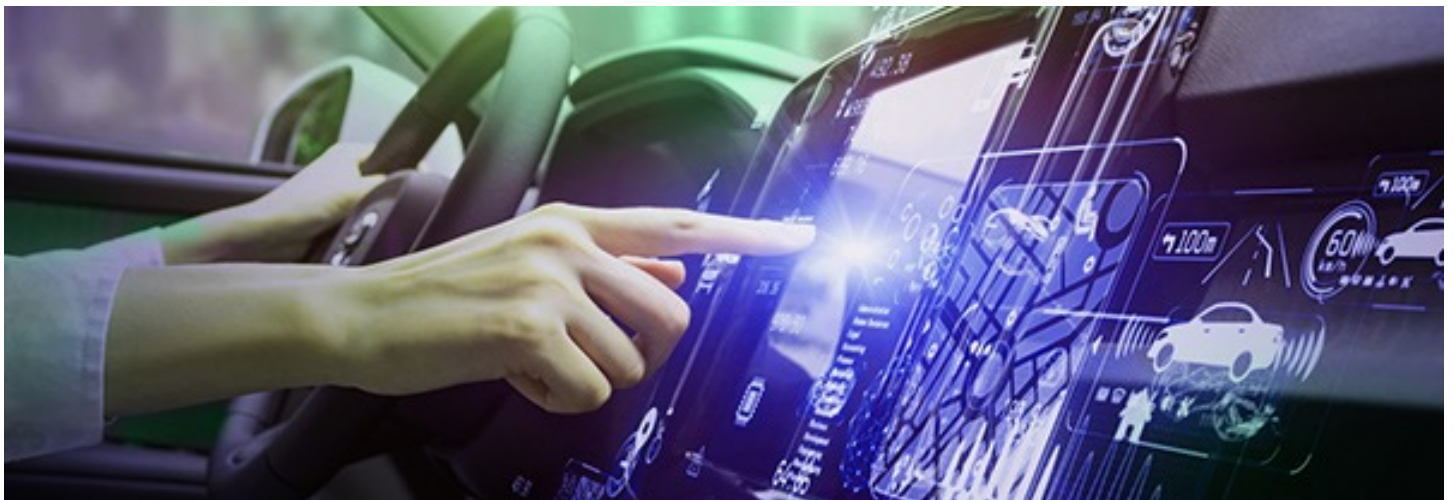
Photo: A steering wheel and dashboard. A driver’s left hand is on the steering wheel, while their right hand is touching a digital screen showing a map.