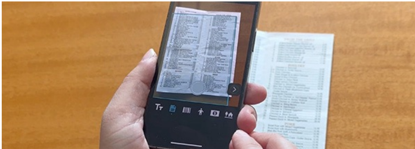
Photo: A hand holding a smartphone scanning a restaurant menu.

A new study shows how artificial intelligence is making life easier and more accessible for people with vision loss. Published in the January edition of Translational Vision Science & Technology , an ARVO journal, the study reveals that individuals with vision loss express high satisfaction when using artificial intelligence (AI) technologies. The research, conducted here at Lighthouse Guild, underscores AI's transformative potential to enhance the lives of people with visual impairments.