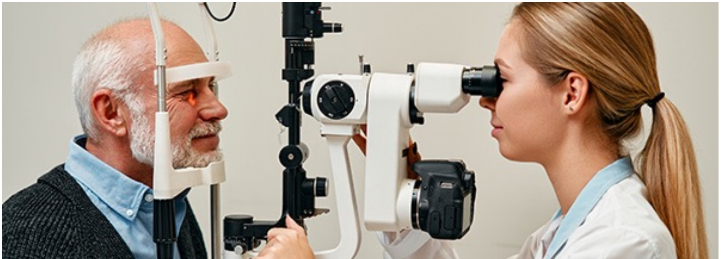
Photo: An older man receiving an eye exam from an eyecare professional.