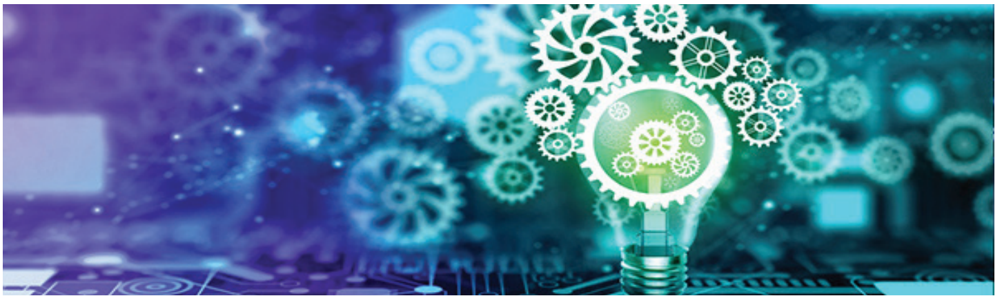
Photo: A lightbulb with glowing machinery cogs, in and around the bulb, connects to a circuitry board. Behind the lightbulb is a background of blurred machinery cogs and circuitry boards.