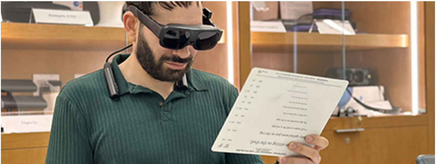
Photo: A man using a head worn device to read an eye chart.