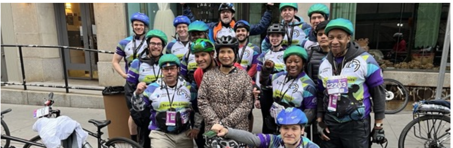
Photo: Participants from the 2024 Lighthouse Guild Team #NoLimits pose before the TD 5 Boro Bike Tour begins.

Lighthouse Guild and the Foreseeable Future Foundation share a common goal: to support individuals of all ages who are blind or visually impaired, along with their families. We are teaming up again this year to form Team #SeeNoLimits – comprised of cyclist who are blind, visually impaired, and fully sighted – and ride in the TD Five Boro Bike Tour . On Sunday, May 4, 2025 , Team #SeeNoLimits will cycle through all five boroughs of New York City to raise awareness and funds that will directly support services for people who are blind or have low vision. Visit our website to join our team and make a difference!