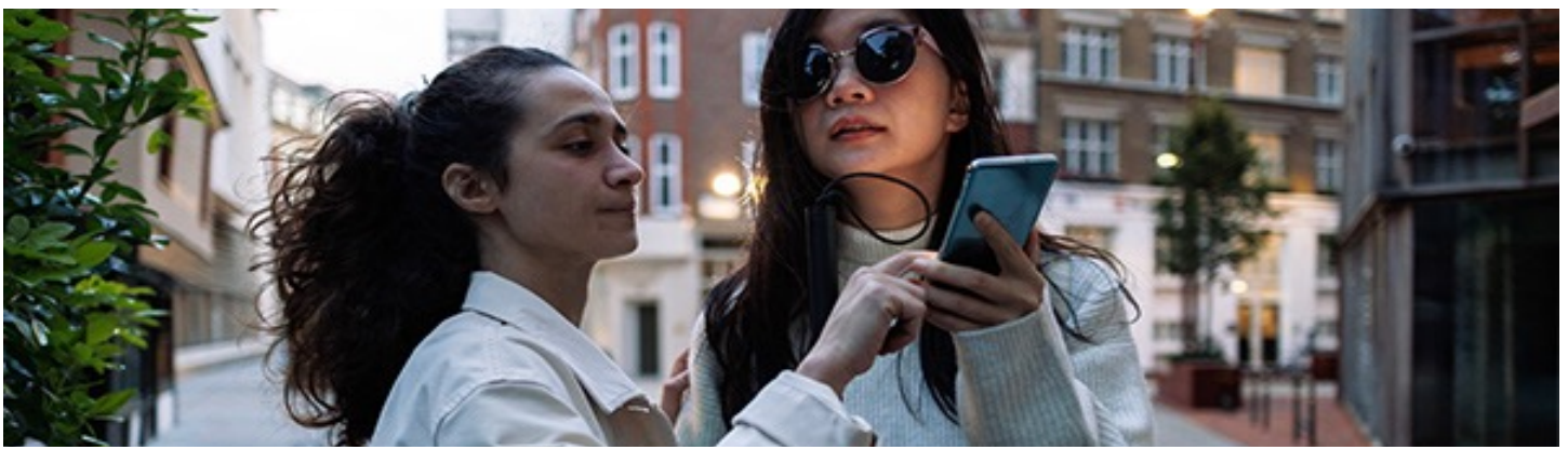
Photo: A woman assisting another woman who is visually impaired with her smartphone.