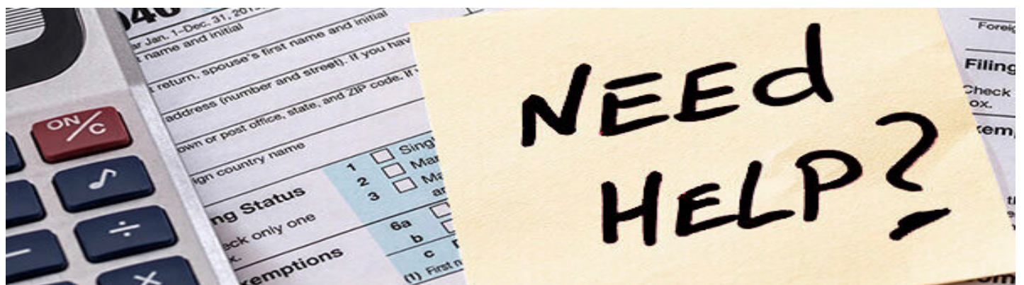
Photo: Part of a calculator sits on a background of tax forms next to a yellow Post-it note that reads “Need Help?”

Lighthouse Guild is offering assistance for individuals who are blind or have low vision in filing their 2024 federal, state, and city income tax returns. This service is provided in partnership with the IRS, Bethpage Federal Credit Union, and Urban Upbound. Tax agents will be available at Lighthouse Guild, located at 250 West 64th Street, New York City, on February 24 and 25 , as well as March 5, 6 and 18 .