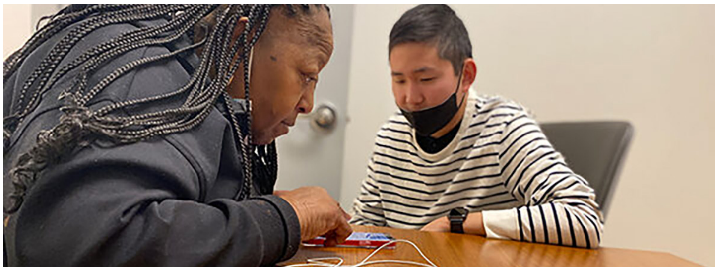
Photo: An older woman trying her iPhone while a young Tech Pal’s mentor guides her.

In recognition of World Sight Day, Lighthouse Guild received a $10,000 grant from Iveric Bio , an Astellas Company, to back our innovative Tech Pals program. Our program pairs tech-savvy young adults (aged 18-24) who are blind or visually impaired with older adults (aged 55+) who are visually impaired and want to become proficient in using mobile phones and tablets. Tech Pals not only imparts skills and support but also fosters meaningful connections between two generations of people with vision loss. We are grateful to Iveric Bio for their generous support of this initiative and collaboration on World Sight Day.