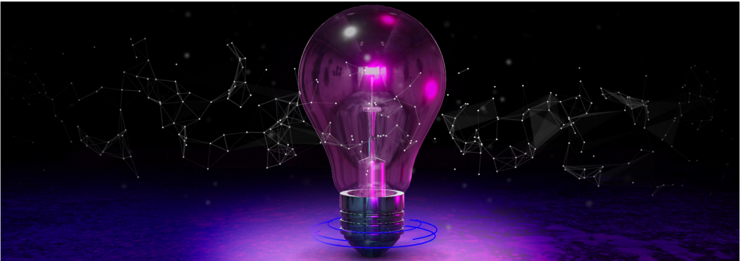
Photo: a lit dark purple lightbulb with white dots and joined lines flowing over it to suggest the concept of “ideas.”