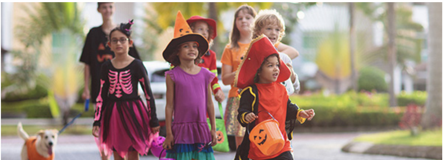
Photo: Five children dressed in Halloween costumes trick or treating followed by a parent and a dog walking behind them.