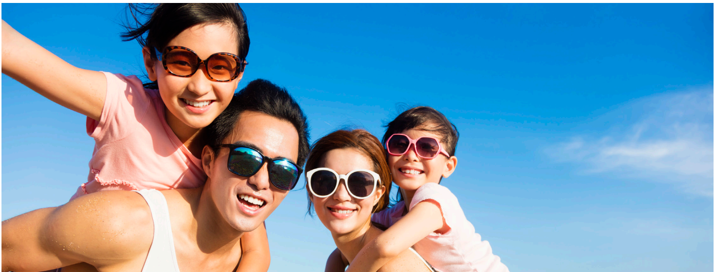
Photo: A family of four outdoors wearing sunglasses. The two young girls are on the shoulders of their father and mother.

Most of us remember to protect our skin from the sun, but it's essential to protect our eyes as well. "Exposure to ultraviolet (UV) radiation from the sun can damage the eyes and cause vision loss later in life," says Dr. Susan Weinstein, Low Vision Optometrist at Lighthouse Guild.