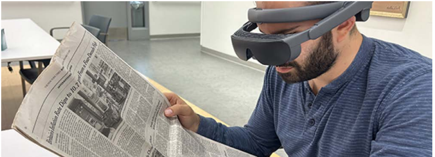
Photo: A man seated reading a newspaper using a head-mounted display device.

Advances in hardware and software technologies have led to the development of assistive technology devices that may help people with vision loss achieve their goals, including reading and performing activities of daily living. A recent study published by Lighthouse Guild’s research team in the Ophthalmic and Physiological Optics, the Journal of the College of Optometrists , explores the performance, acceptance, and usability of head-mounted display devices.