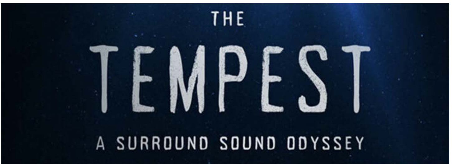
Image: Dark background with white text that reads “The Tempest: A Surround Sound Odyssey”

Lighthouse Guild has partnered with Knock at the Gate to bring a unique experience to individuals who are blind or visually impaired. This collaboration offers the opportunity to enjoy Shakespeare’s The Tempest in 3D surround sound from the comfort of home or any preferred location.