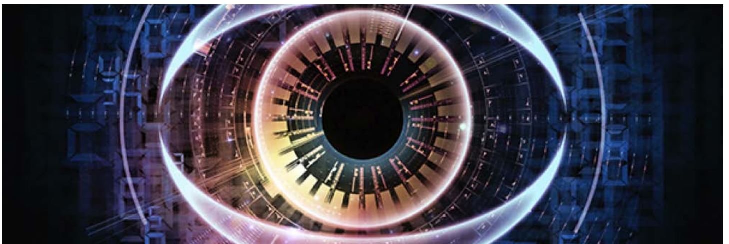
Illustration: Colorful digital eye surrounded by numbers on a dark backdrop of circuitry.

The latest “On Tech and Vision” podcast episode delves into the challenging pursuit of vision restoration. I discuss my work as program manager for a project on eye transplantation called Transplantation of Human Eye Allografts (THEA). Funded by a new federal agency ARPA-H, THEA is bringing some of the country’s finest minds together to tackle the complexities of connecting a person’s brain to an eye from a human donor. Though connecting a donor eyeball to a recipient’s brain has yet to be successful, rapidly advancing technology is bringing us exciting new possibilities to achieve this and restore vision.