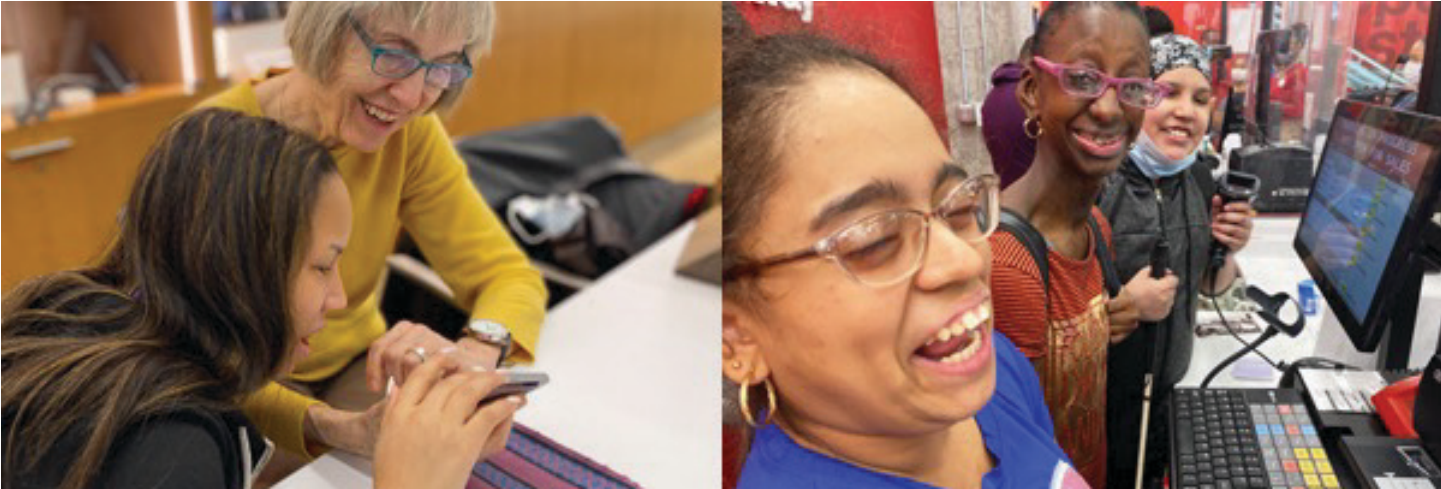
Photos: Left to right, a female mentor in the Tech Pals program providing mobile phone instruction to an older adult woman; Three young women of the Summer Youth Pathways program learning about Target’s check-out system.

I am pleased to announce renewed support from The Graham Family Foundation ($17K) for our Tech Pals and Summer Youth Pathways initiatives! Tech Pals is our exciting intergenerational technology training program, tech-savvy young adults (aged 18-24) who are blind or visually impaired serve as mentors to older adults (aged 55+) who are also visually impaired and want to become proficient in using their mobile phones and tablets. The Summer Pathways Program brings approximately 15 teens together daily to explore careers, participate in community enrichment activities and field trips, and learn pre-employment and job readiness skills.