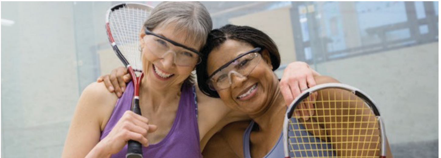
Photo from left to right: Two women holding racquets and wearing sports goggles.

Every year in the U.S., 100,000 eye injuries are related to sports activities. Around 13,500 of these injuries lead to some degree of permanent vision loss. A regrettable outcome, especially since 90 percent of sports-related eye injuries can be prevented by using protective eyewear.