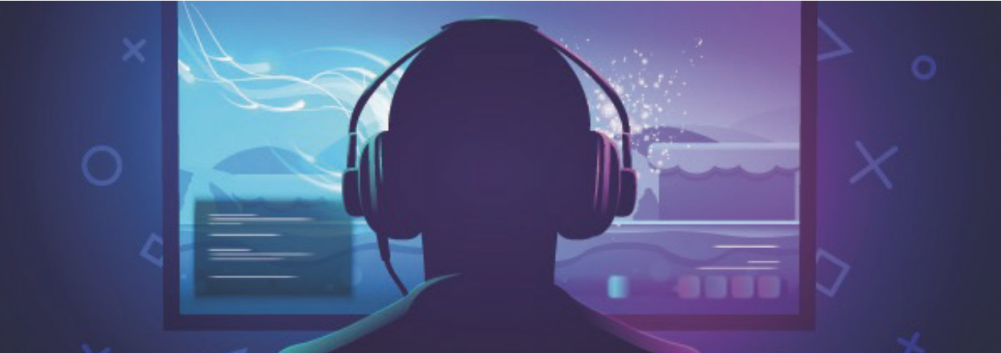
Photo: The back view of a player wearing head phones sitting in front video game monitor with graphics swirling around the monitor.